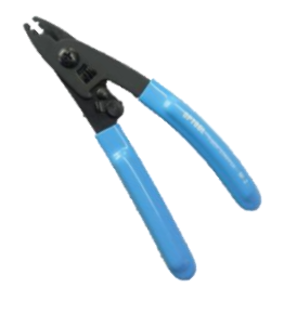
LTS-212/213 Fiber Stripper