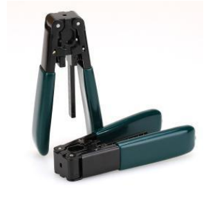
Model: LTS-242 FTTH Drop Cable Stripper